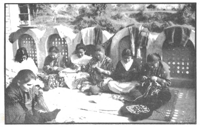
The women under rehabilitation program are involved in preparing sweaters as a means of earning

The resident women have been provided with non-formal education (literacy, legal education and awareness about hygiene and health including STDs and AIDS) and skill training in knitting and sewing in