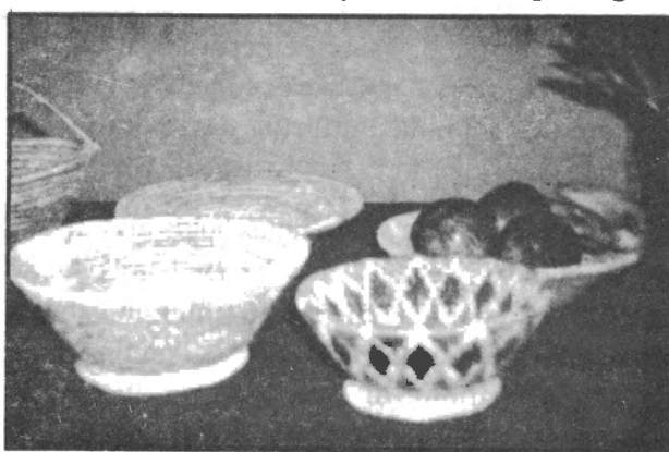
Some of the goods produced out of sikki and thakal

Sikki and Thakal are the locally available wild plants which are used for making various domestic goods in Udayapur and other parts of the country. Aimed at exploring the use of these plant species as a source